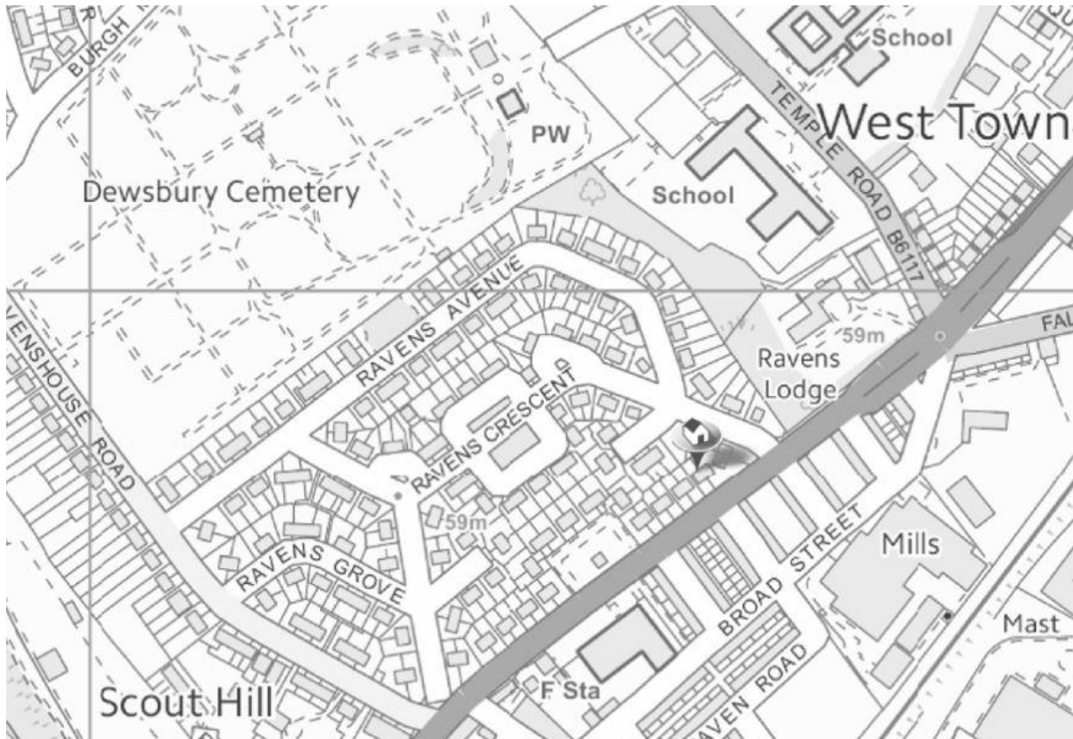
Map not to scale – for identification purposes only